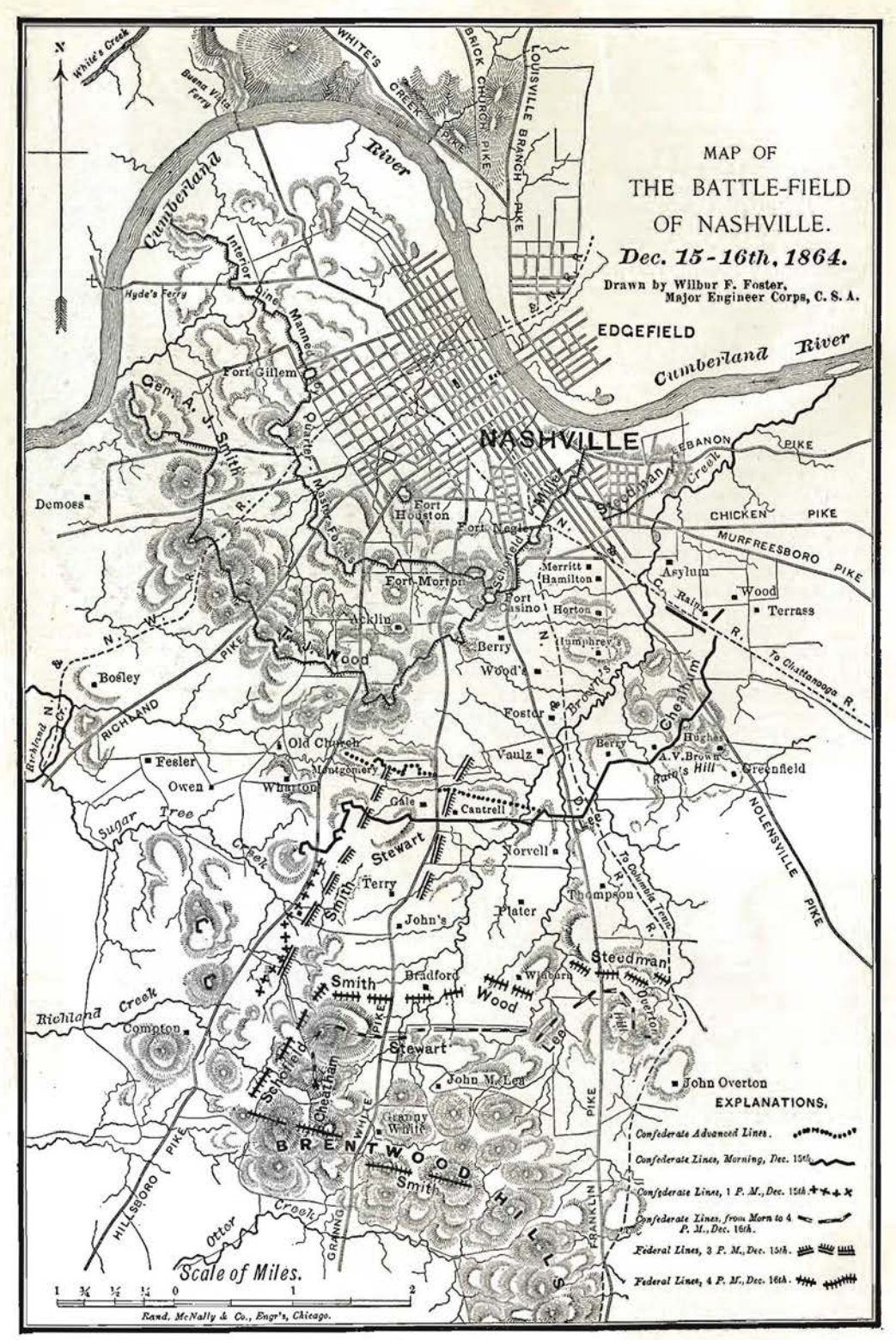
FROM THE " BIVOUAC " FOR AUGUST, 1886.