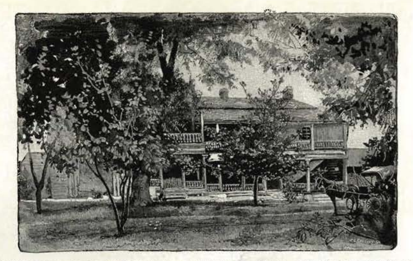
OVERTON'S HOUSE, HOOD'S HEADQUARTERS AT NASHVILLE. FROM A PHOTOGRAPH TAKEN IN 1884.

the ground was obstinately contested, and at several points upon the immediate sides of the breastworks the combatants endeavored to use the musket upon one another, by inverting and raising it perpendicularly, in order to fire; neither antagonist, at this juncture, was able to retreat without almost a certainty of death. It was reported that soldiers were even dragged from one side of the breastworks to the other by men reaching over hurriedly and seizing their enemy by the hair or the collar.